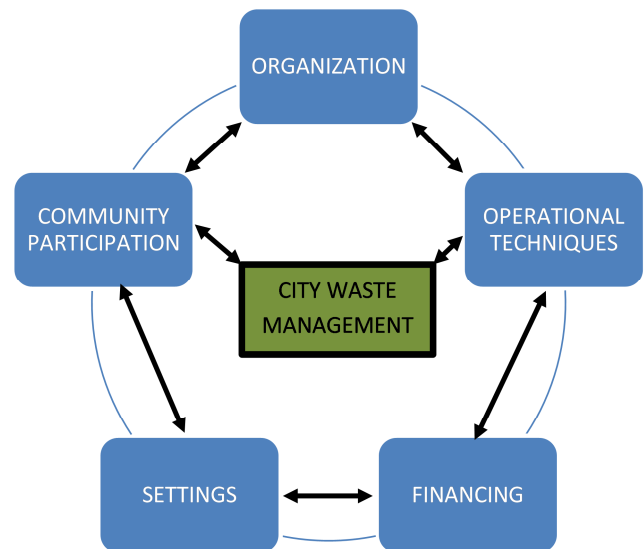
Figure 1. General system of waste management.

In the implementation of waste management in the city of Pekanbaru, the first step needed is the existence of a clearer working concept and strengthening the work pattern so that the range of goals to be achieved can be formulated more realistic but still efficient and effective. Pekanbaru city waste management system can consist of smaller subsystems, namely: (3.3.1.1). Sub Organization, (3.3.1.2). Operational Sub Engineering, (3.3.1.3). Sub Financing, (3.3.1.4). Community Participation Sub and (3.3.1.5). Organizational Settings Sub.