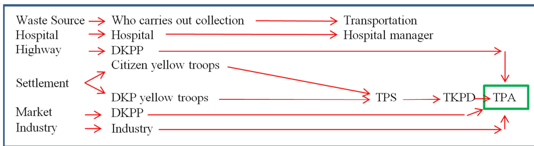
Figure 2. Conceptual model for transporting municipal waste from waste sources to landfill.