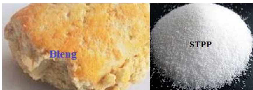
Figure 2. Sticky and cracker maker of crispy.

Bleng and STPP (Sodium Tripolyphosphate) as Shown on Figure 2.