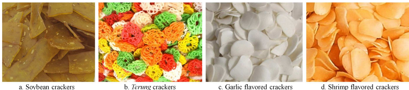
Figure 1. Various cracker products.

during the cracker manufacturing process and the final action in drying. Most of the cracker producers drying directly on the ground are only covered by plastic or woven bamboo, even the drying position is also carried out on the roadside which is loaded with vehicles passing by. This causes the quality of the crackers produced to be questionable for their consumers' health.